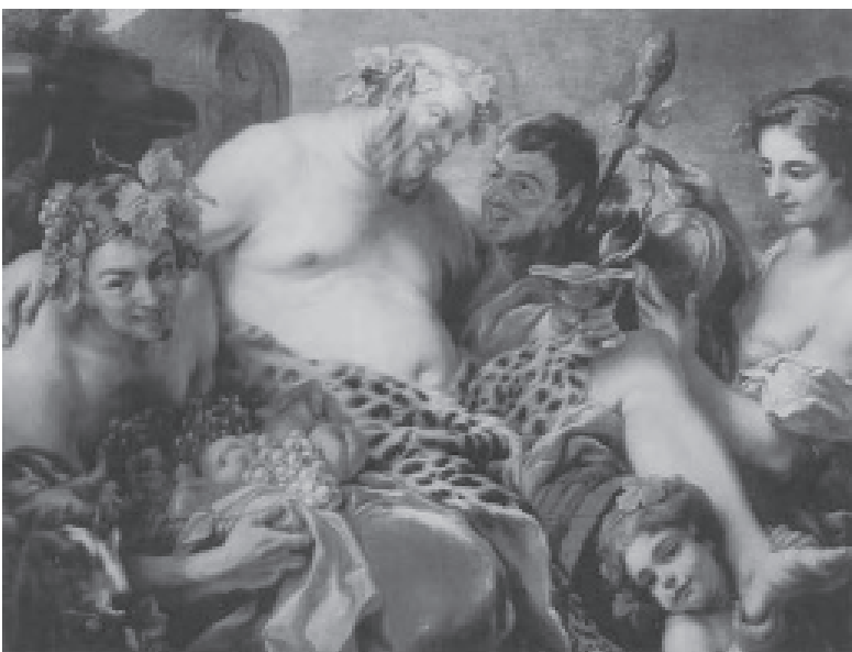
Silenus - Charles Andre van Loo