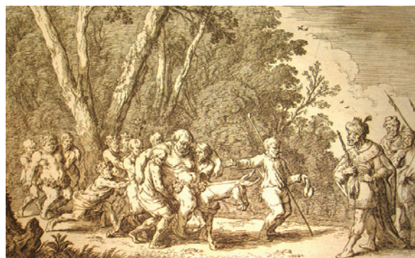
Midas & Silenus - Johann Wilhelm Baur, Edition 1659