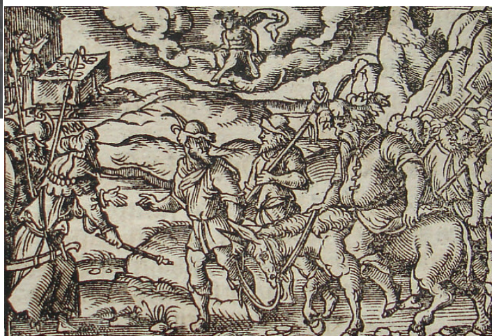
Midas & Silenus - Virgil Solis, Edition 1581