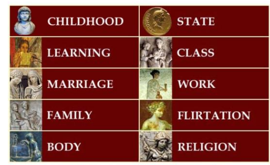
Explore the Worlds of Roman Women in Texts and Images

TEXTMAP (list of Companion texts), AUTHORS, WOMEN